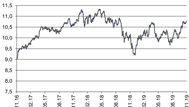
Share price movement (last 36 months)

In November we sold Valmet equities and reduced Stora Enso and UPM Kymmene positions. We also exited Japan and European banking sector index funds. At the same time we added TCM Group, Coor and Swedbank equities.